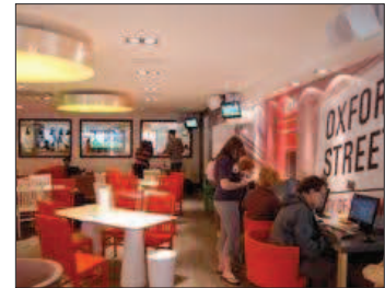
YHA London images

“Through YHA, people are able to explore new places, to understand different cultures: an experience which encourages and enhances the growth of all.”