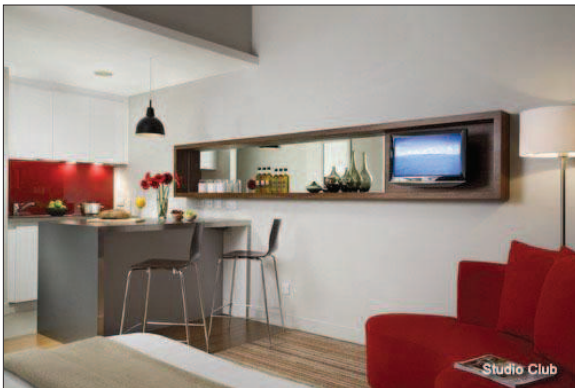
Citadine 'London Holborn' – Covent Garden

Citadines Apart'hotel is one of the biggest aparthotel providers worldwide, with four locations in London. Extracts from their website refers to their Apart'hotel as follows.