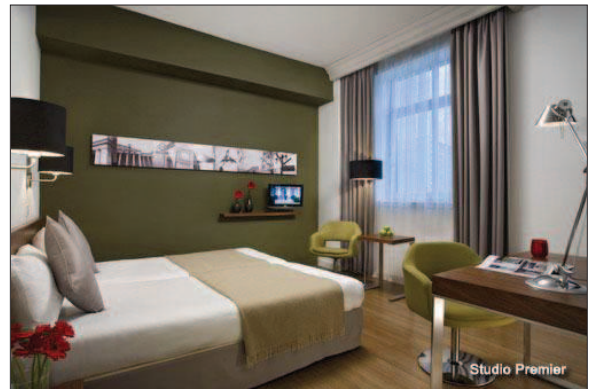
Citadine 'London Holborn' – Covent Garden

"When you have to work and live away from home, changing your location doesn't have to mean changing your lifestyle. At Citadines, we'll help you live the life you want, anywhere in the world."